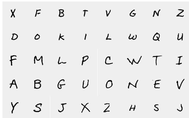
Fig. 3. Some examples of upper handwritten characters from the NIST Database 3.

Each experiment were repeated 10 times using training and test sets with 1080 samples on average.